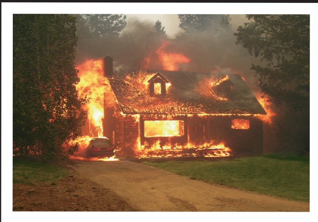
This house was ignited by burning embers landing on vulnerable spots. Notice the adjacent forest is not burning.

Maintain wooden fences in good condition and create a noncombustible fence section or gate next to the house for at least five feet.