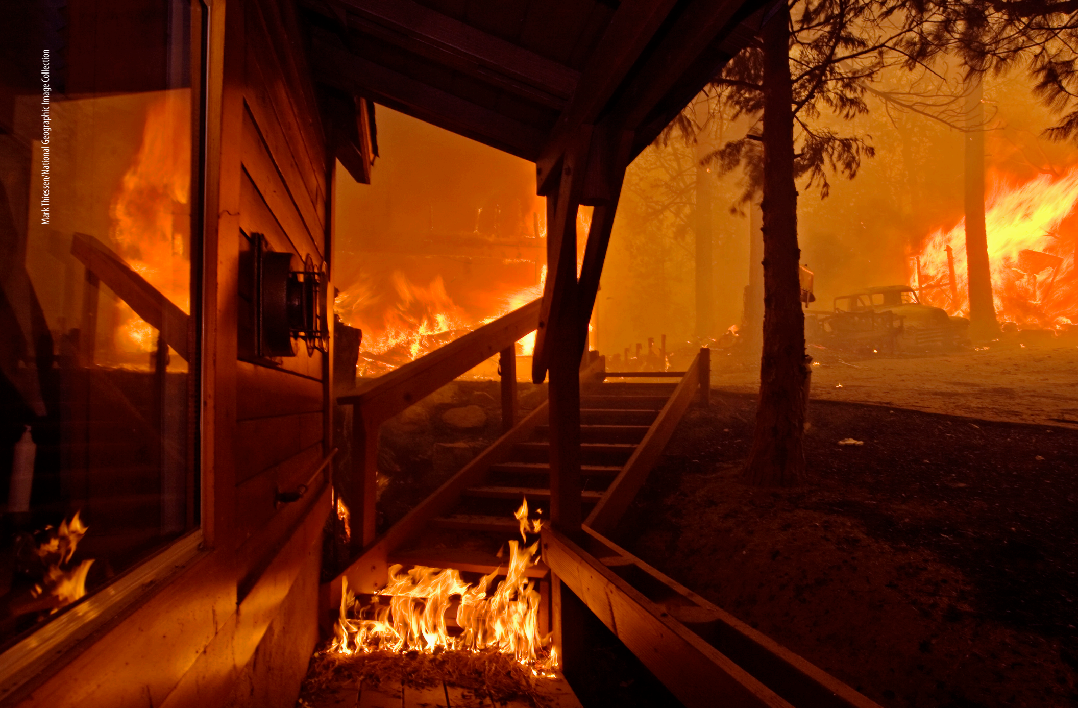
A wooden house, a small pile of pine needles and glowing embers ...