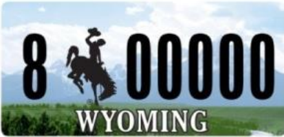
2017-2025 Green Lake Series